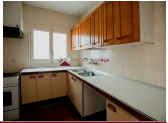
Principality of Andorra / Encamp