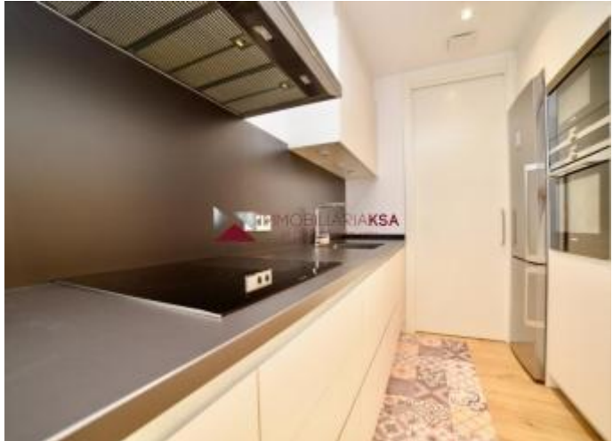
Apartment - Andorra la Vella